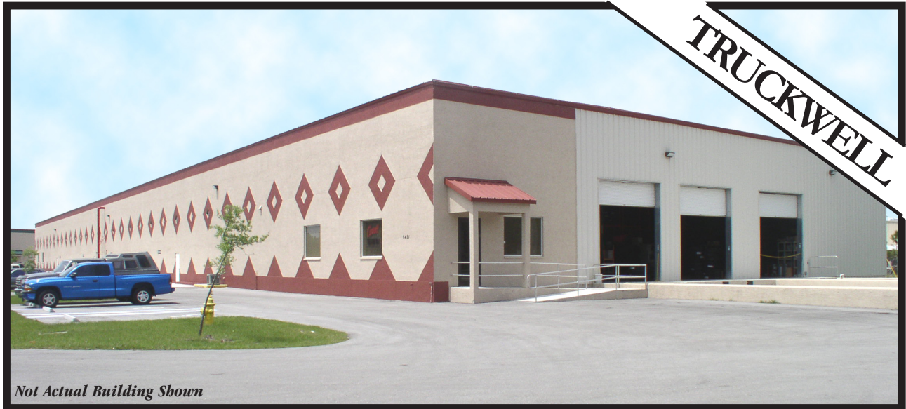
Not Actual Building Shown

LOCATION: Phase VII Metro Plex Drive, Fort Myers, FL 33912