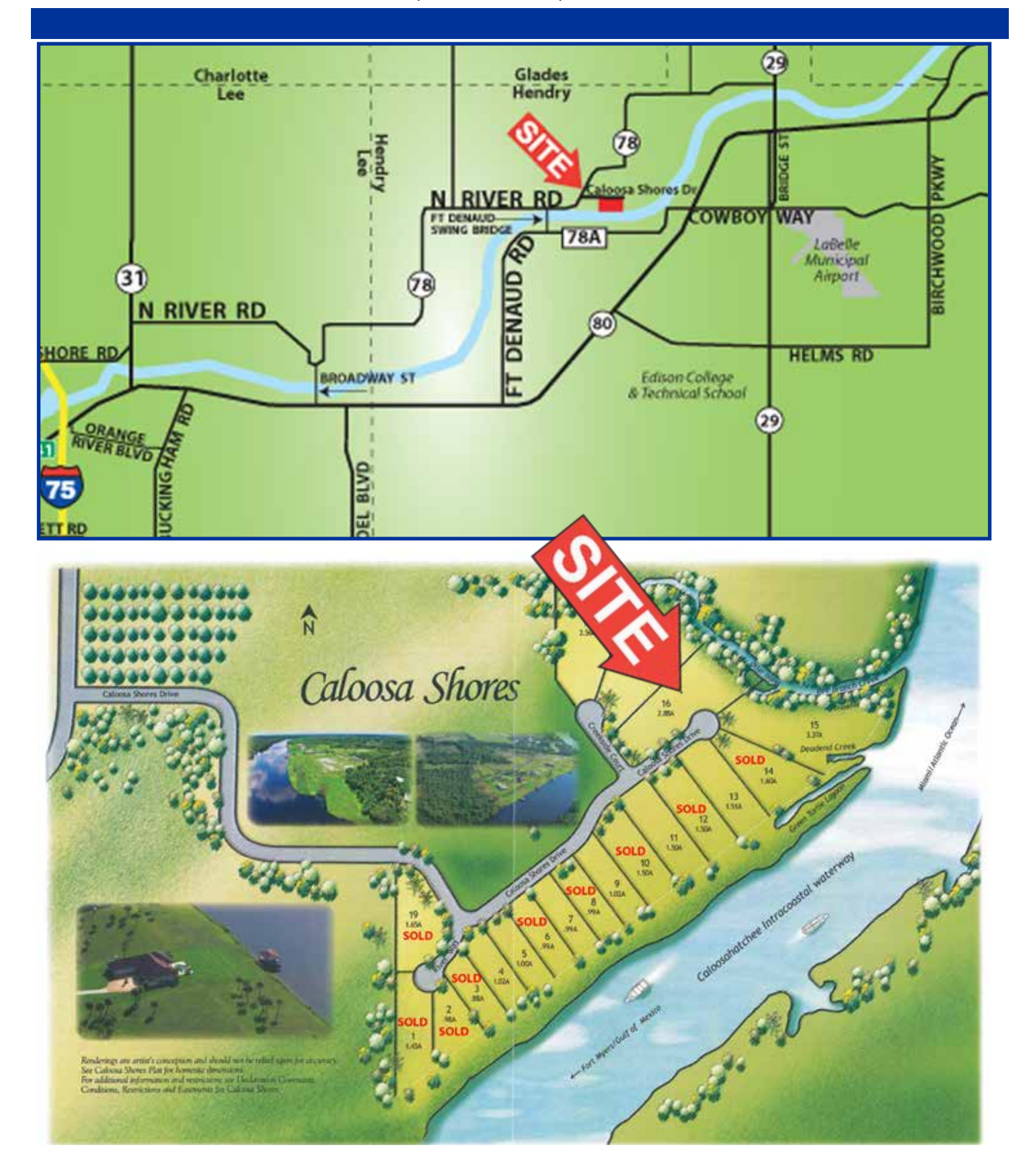
2550 Caloosa Shores Dr., LaBelle, FL 33935