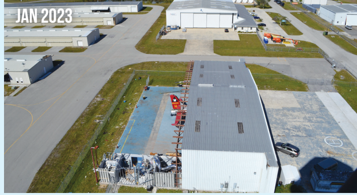
TGH Aeromed relocated to another onsite hangar