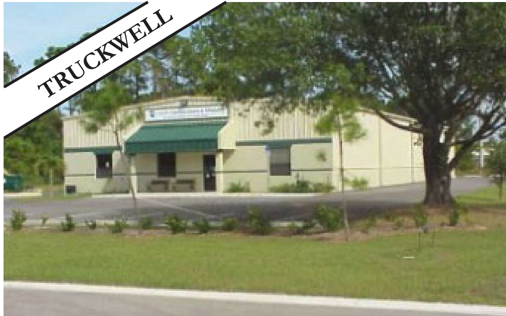
Not actual building shown. Building will have same architecture.