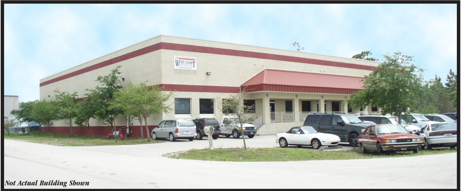
Not Actual Building Shown

LOCATION: Phase VIII Metro Plex Drive, Fort Myers, FL 33912