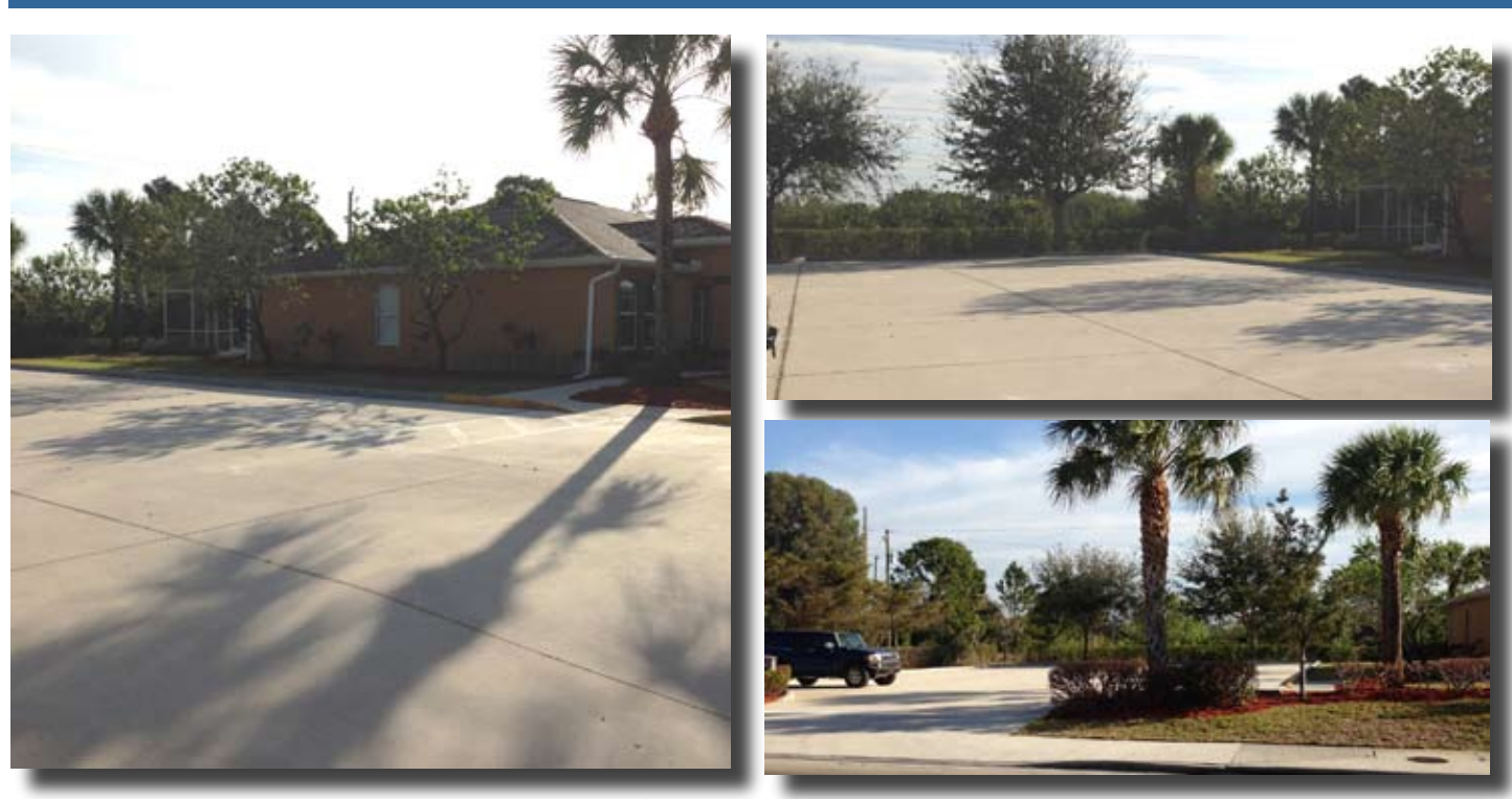
Plenty of Paved Parking / 19 spaces