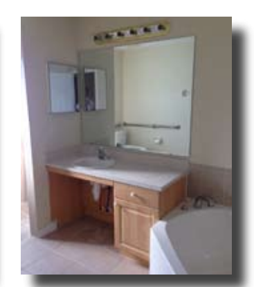
Reception area / 4 Private Offices / 2 Bathrooms