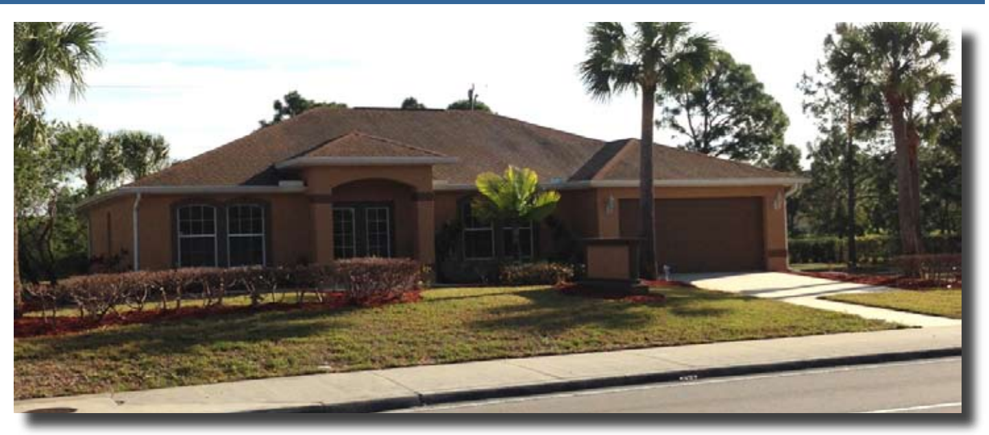
Former model home perfect for office, medical, commercial, assisted living and more.