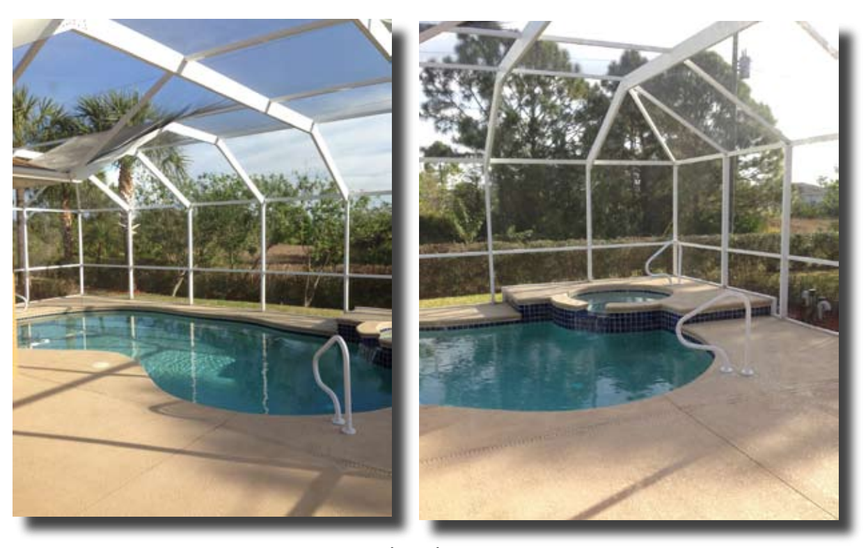
Screened Pool & Spa