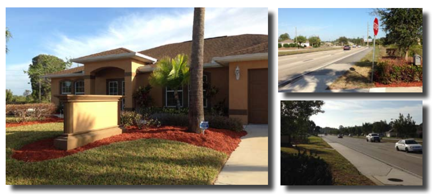
Excellent Signage & High Visibility on Lee Blvd.