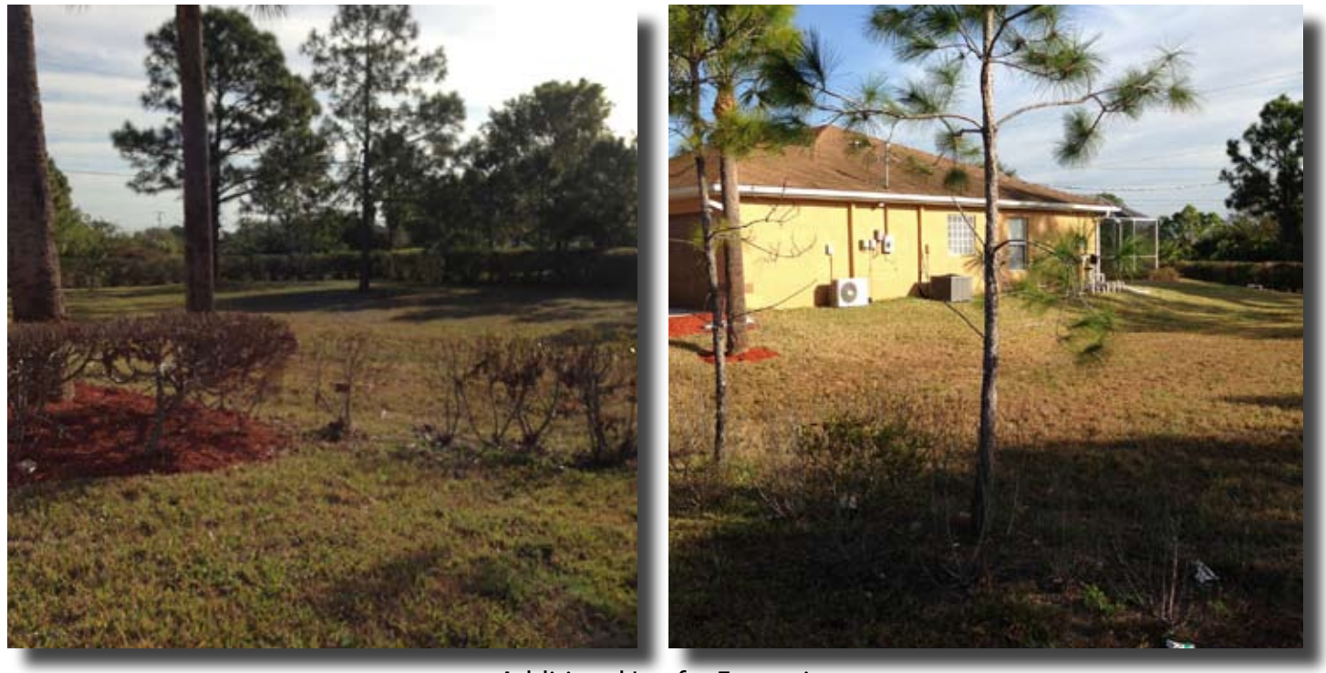
Additional Lot for Expansion