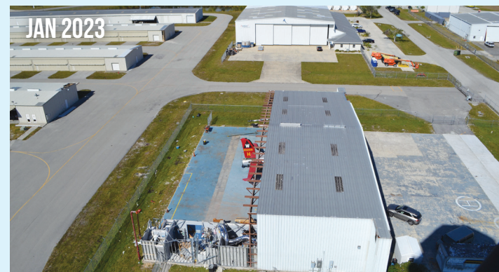
TGH Aeromed relocated to another onsite hangar